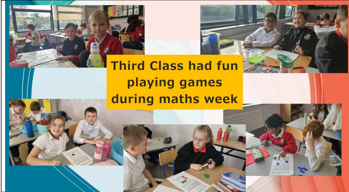
Third Class had fun playing games during maths week